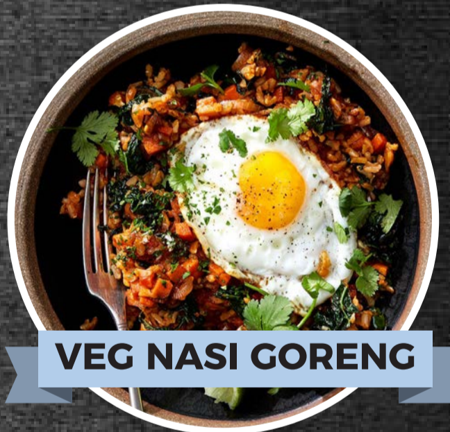
VEG NASI GORENG